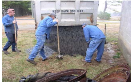
Employees from Branch Welding Excavating look down into the well as it is filled with gravel during the well capping process.

To protect groundwater quality the RC&D Council capped four wells in Greensville County. The wells were determined to be a safety hazard or had potential to be a point source to groundwater contamination. Landowners received cost share assistance between 50% - 100% for wells to be capped. Since 2004, the RC&D Council capped a total of eight wells in five counties.