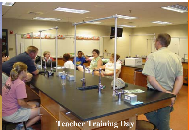
Teacher Training Day