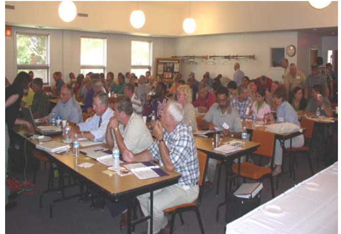
Participants in attendance at biodiesel workshop.

The South Centré Corridors RC&D Council partnered with Virginia Clean Cities and Virginia Department of Mines, Minerals and Energy to conduct the workshop.