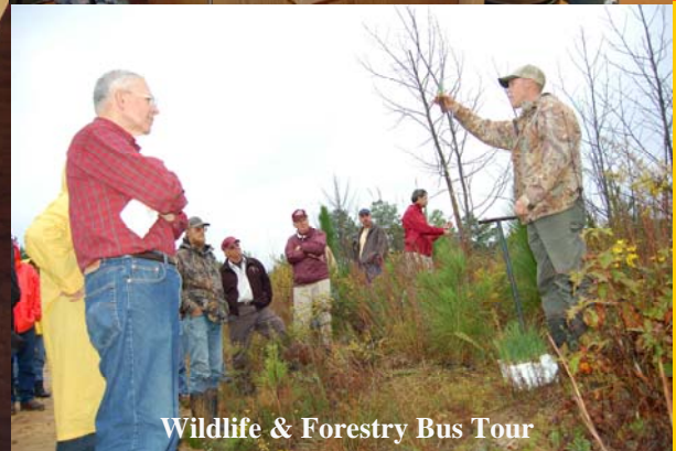
Wildlife & Forestry Bus Tour